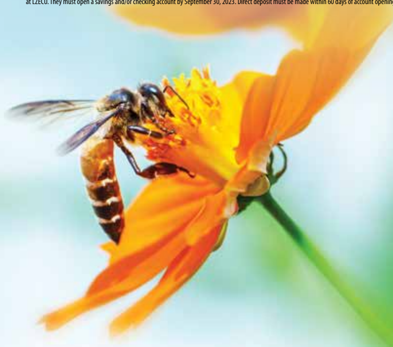
Chart your own COURSE

*Membership promotion applies only to family members and friends employed by Lubrizol Corp Texas facilities and subsidiaries that have never been members at LZECU. They must open a savings and/or checking account by September 30, 2023. Direct deposit must be made within 60 days of account opening.